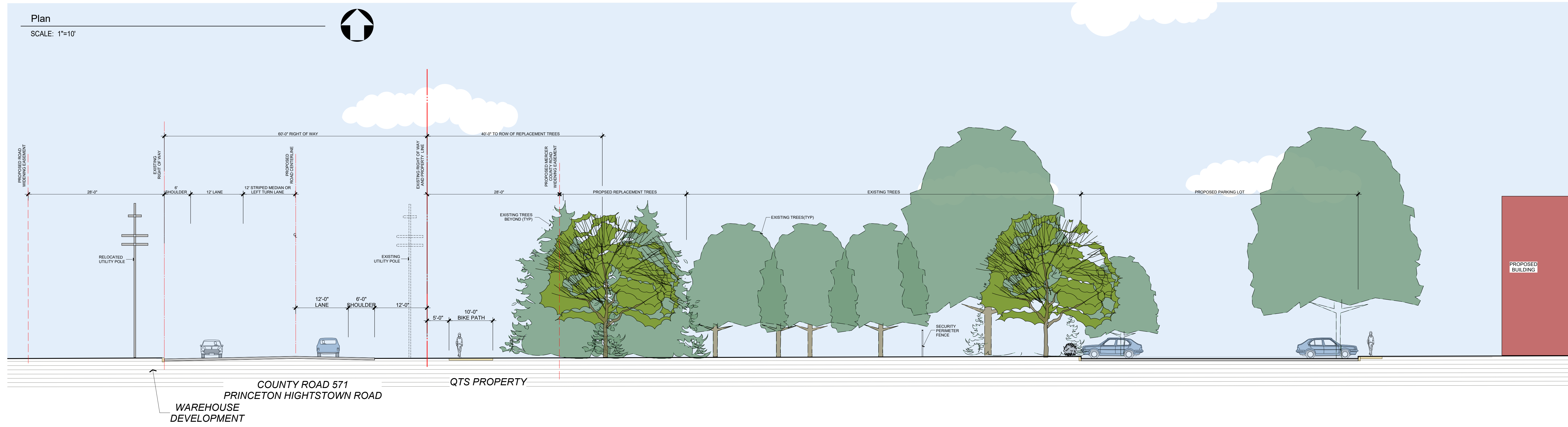
1 Site Section - Existing SCALE: 1"=10'