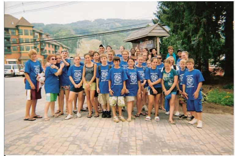
East Windsor Township Recreation Senior Travel Camp staff and campers spend a fun-filled day at Mountain Creek.